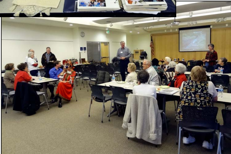
Cheyenne's Friendship Force Reception